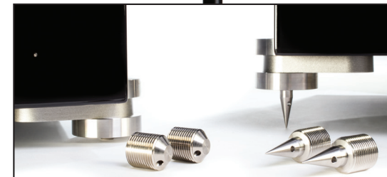
Titanium Feet or Carpet Spikes (sold sep.)

Extruded-Aluminum Center Heatsinks: Provide internal forced-air cooling to force heat away and increase power handling while reducing distortion.