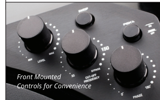
Front Mounted Controls for Convenience