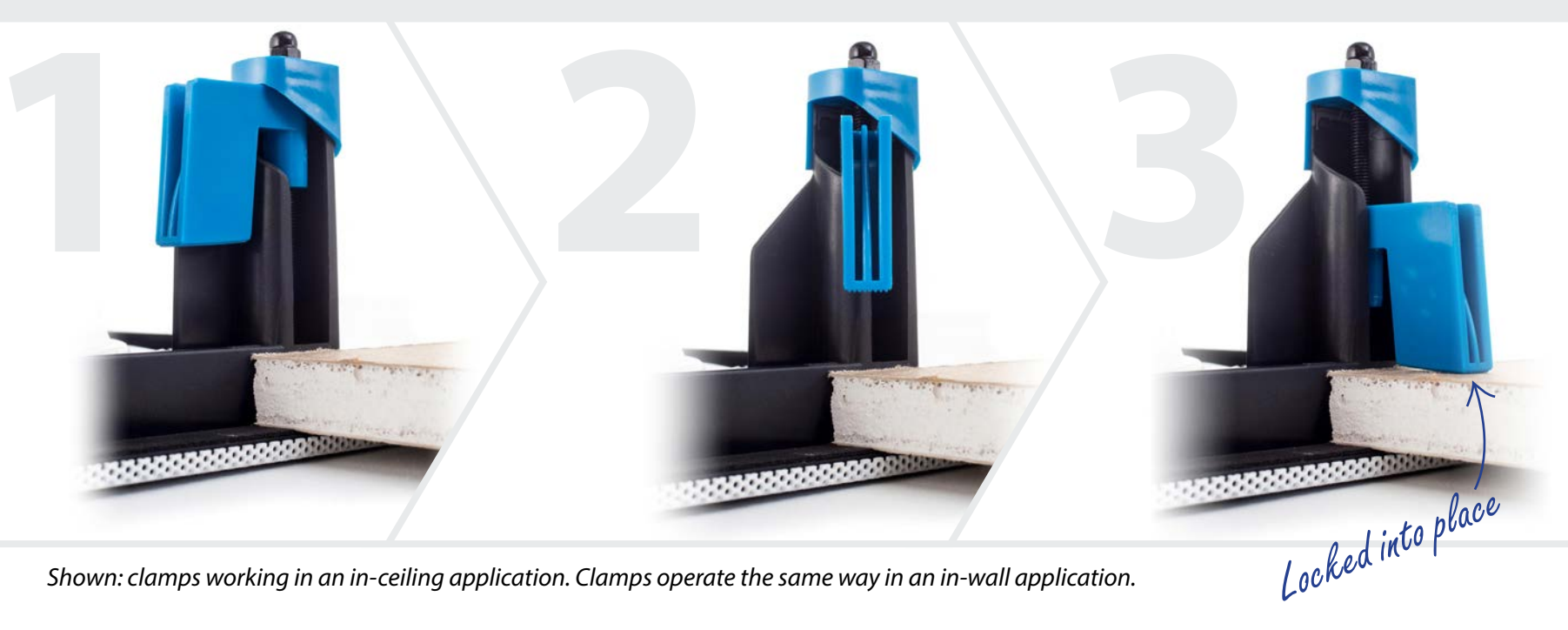
Shown: clamps working in an in-ceiling application. Clamps operate the same way in an in-wall application.

Without any unnecessary pressure or force, each turn of the screwdriver turns the clamp. We show the starting point, we show the screwdriver working to turn the clamp, and finally, we show the speaker locked into place inside the wall or ceiling. It doesn't get simpler or easier!